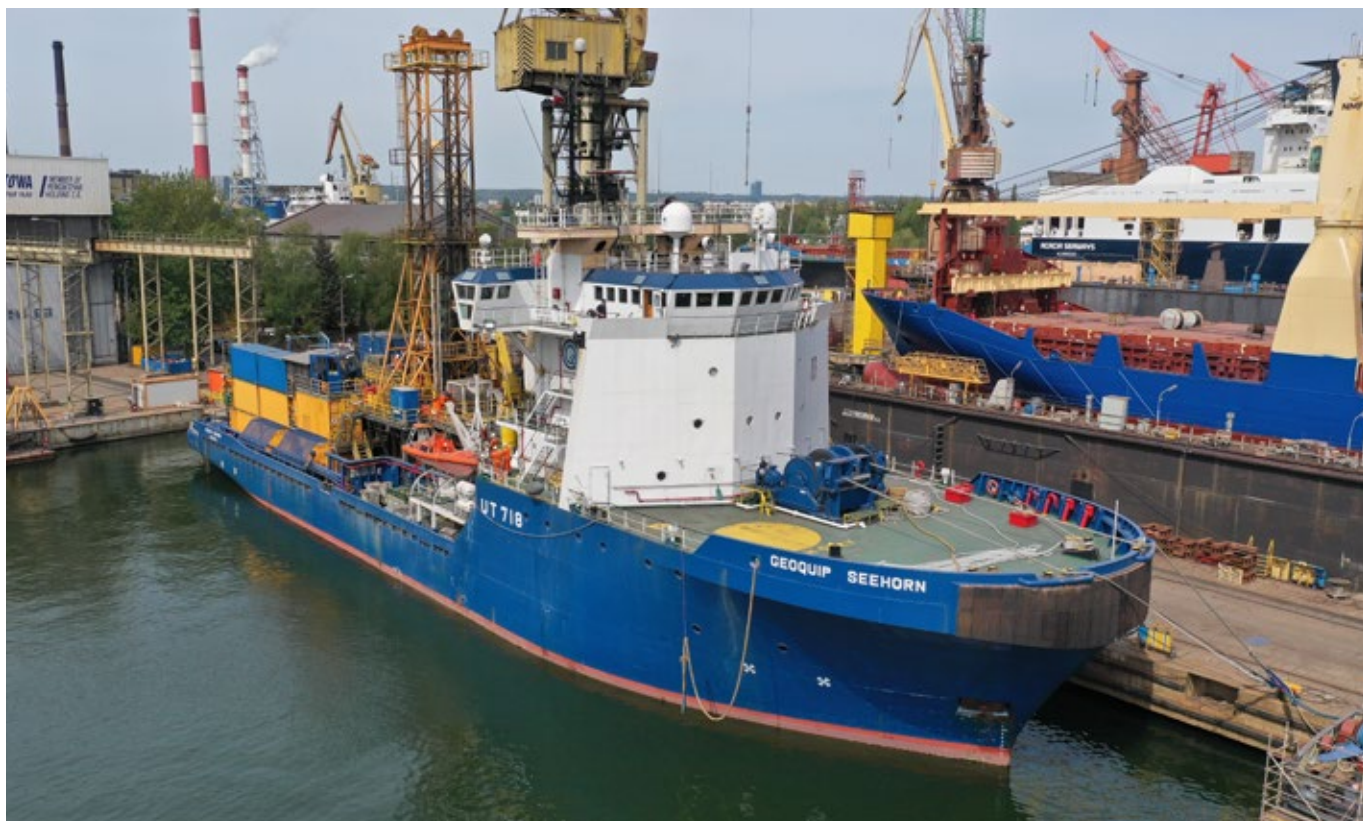
The Geoquip Seehorn in 2022 was prepared by Remontowa for a new offshore project